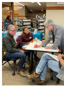
Age Friendly Community Listening Session