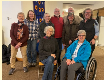
Care Partners Board—2023

This year I look forward to working on the goals and activities we're planning for Care Partners and to seeing the impact they have on people's quality of life and ability to keep living safely in their homes. And I look forward to keeping up the relationships with the people and partners I've come to know through Care Partners. And to creating new ones!