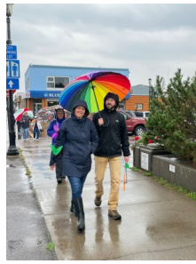
Walk to End Alzheimer's Grand Marais Team