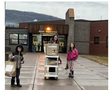
Sawtooth Elementary Gift Bags!

Bethlehem Lutheran Church Blue Water Cafe Cedar Grove Veterinary Clinic Coldwell Banker Cook County Whole Foods Co-op First and Second Thrift Store Grand Marais Lions Club Hamilton Habitat Holiday Station Store/ Grand Marais Lande Construction Lutsen Evangelical Lutheran Church North Shore Federal Credit Union-GM Northern Wilds Media Oddz & Endz Red Pine Realty Sawbill Canoe Outfitters Schwab Charitable Grant Security State Bank Sivertson Studio, Gallery & Frame Shop Subway Timberwolff Realty Tuscarora Lodge & Canoe Outfitters W.I.S.E. Worlds Best Donuts