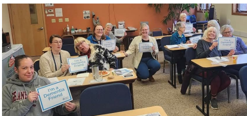
Dementia Friends Lunch and Learn