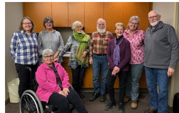
Care Partners Board of Directors January 2025 Thank you for your commitment!

American Legion Post 2009 Bethlehem Lutheran Church Beth's Fudge and Gifts Cedar Grove Veterinary Clinic Charles & Andriene Johnson Foundation City of Grand Marais Cook County Potters Cook County Whole Foods Co-op Drury Lane Books Fidelity Charitable First and Second Thrift Store Grand Marais Art Colony Grand Marais Family Dentistry Grand Marais Lions Club Grand Portage Tribal Council Great Gifts Mike's Holiday Station Store/ Grand Marais Johnson's Foods Lutsen Evangelical Lutheran Church Mathison & Vos PLLC Minneapolis Foundation Mississippi State University Foundation North Shore Federal Credit Union-Grand Marais North Shore Waste Oddz & Endz Red Pine Realty Sivertson Studio, Gallery & Frame Shop SJ Bautch Construction Subway Thrivent Tuscarora Lodge & Canoe Outfitters W.I.S.E. World's Best Donuts