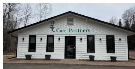
Care Partners New Location 615 East Highway 61—Grand Marais