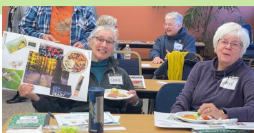
Reframing Aging Workshop