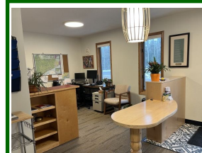
New Office Reception

Together, over the years, Care Partners has gratefully given and received strength, witnessed resilience in ourselves and others, and grown through it all. As we prepare to celebrate 10 years as our own independent 501(c)3 non-profit organization, we enter a new season of growth. Toward the end of 2024, we learned that we needed to find a new location. We are so very grateful to Sawtooth Mountain Clinic for allowing us to grow and develop in the lower-level space we called "home base" for so many years. And just as our volunteers have wonderfully shown up for our community, we were humbled to see our community in turn "show up" for us. In only two months, we were able to move into a space that began as a big, empty room, and is now a warm and inviting suite of offices. To the tradespeople and volunteers who came to build, bring plumbing, electrical, internet, flooring and extra touches - as well as painting, sanding, wall papering and, of course, moving...thank you! We invite the community to join us in celebrating 10 years of Strength-Resilience-Growth at our new home base at 615 East Highway 61 on Tuesday, May 20th from 4-6pm . We will have tours, live music, refreshments, and we'll celebrate that, in Cook County, we are not alone.